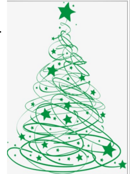
VIRTUAL Christmas Tree Lighting

Gammill Park is annually transformed to a Holiday Wonderland & despite the current Covid-19 pandemic the tradition will continue. In the interest of public health and continued limitations on the size of public gatherings, this year's annual Christmas Tree Lighting festivities will take place virtually and be available for viewing beginning Saturday, December 5th. On the same day, the 2020 Holiday Light Display will begin and includes a limited number of lighted wireframe images and messages, trees wrapped in lights, and premiering a new lighted 22-foot tree with over 100,000 glowing LED lights. It's a true whimsical holiday wonderland! This year's dazzling show of 1.5 million lights dancing to the music has been staged to be enjoyed from the comfort of your own car! Tune in to 91.5 FM for exciting Christmas tunes, synchronized to the lights, that will put a pop in your holiday step, as you drive down Gammill Street and through Community Park! Enjoy watching the virtual tree lighting with your family, from the comfort of your own home, which can be viewed online at www.Haslet.org and on the Haslet Parks and City of Haslet Facebook pages.